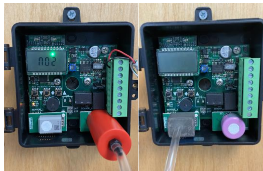
Figure 1: Gas shrouds secured over respective sensing elements. Left is TGUL Shroud for all other gases; Right is CO shroud for CO elements.