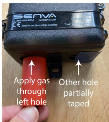
Figure 3: Applying test gas with enclosure closed.