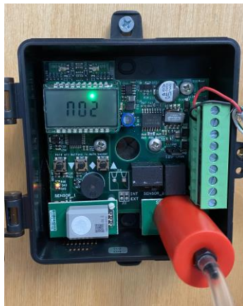
Figure 2: Recommended calibration check setup